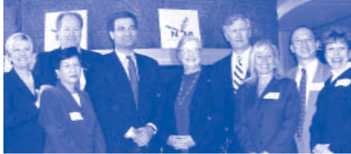
Donors and politicians join Nova House Community Campaign organizers for the campaign launch at The Fairmont Vancouver Airport.