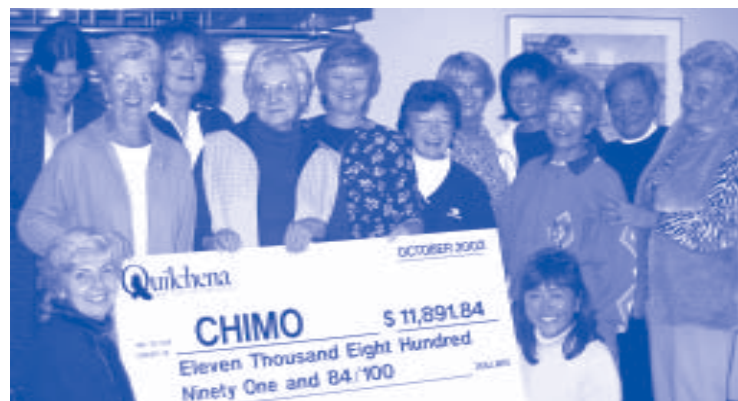
Volunteer organizers of the Women's Charity Golf Tournament at Quilchena Golf & Country Club give generously to CHIMO.

Ministry of Human Resources Minoru Sports & Fitness Rehab Centre Nationwide Hotel Supply Inc Thompson Community Centre - Night Shift Group Our Saviour Lutheran Church P.E.O. Sisterhood Chapter AF P.E.O. Sisterhood Chapter BI Preceptor Gamma Theta Purdy Chocolates Ltd Quilchena Golf & Country Club Richmond Country Club Richmond Liberal Riding Assoc. Richmond Review Richmond Secondary School Richmond Singers Richmond United Church Women Royal Canadian Mounted Police Sansco Management South Arm United Church Spinoza for Kids Steveston ANAF # 28 Rod & Gun Club Steveston Ladies Auxilliary Steveston Lions Club Telus Employees Teranishi & Associates Inc Textile Arts Guild The Fairmont Vancouver Airport The HYDRECS Fund Unipharm VanCity Community Foundation WCB Helping Hands Club West Coast Knitters Guild Western Starter Ltd Wildwood Custom Millwork Inc Xi Upsilon Zellers Lansdowne